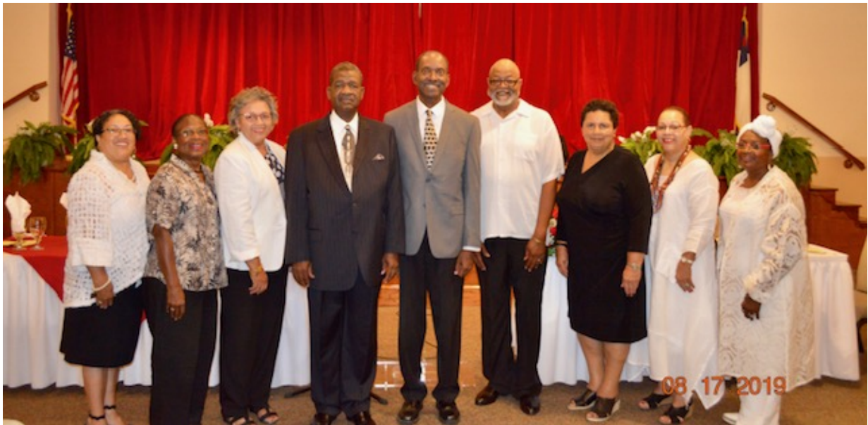
Current Vestry Members and Members of Lunch Program Celebration Committee